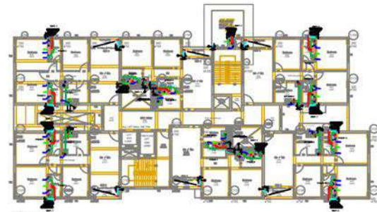
BLOCK 4 TYPICAL FLOOR ( 2ND TO 12TH )